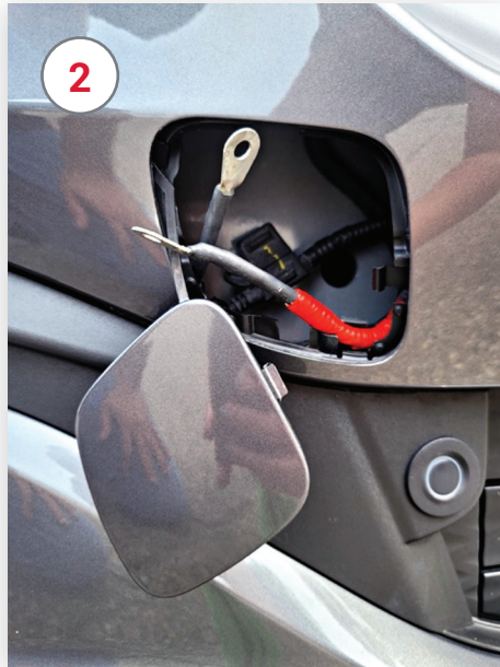
2 Make connections at remote terminals to energize vehicle for entry & open driver door.