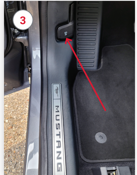
3 Pull front luggage compartment release twice to fully release front cover for opening.