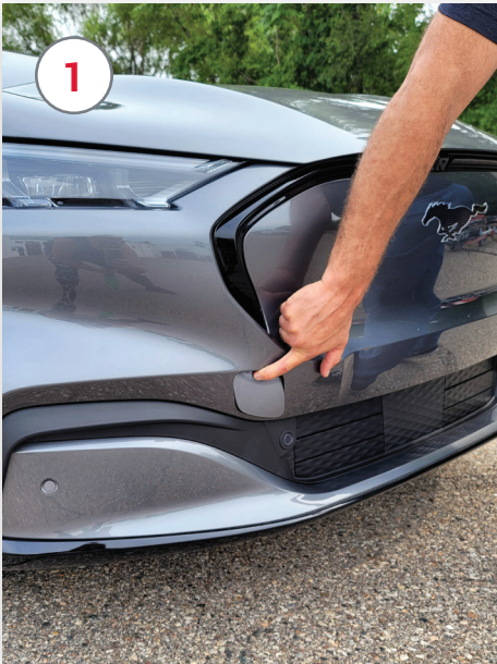
1 Remove panel in front bumper pressing at top to remove from bumper cover.